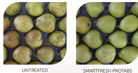
200 Days After Application + 7 Days Of Shelf Life