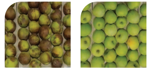
CONTROL SMARTFRESH INBOX